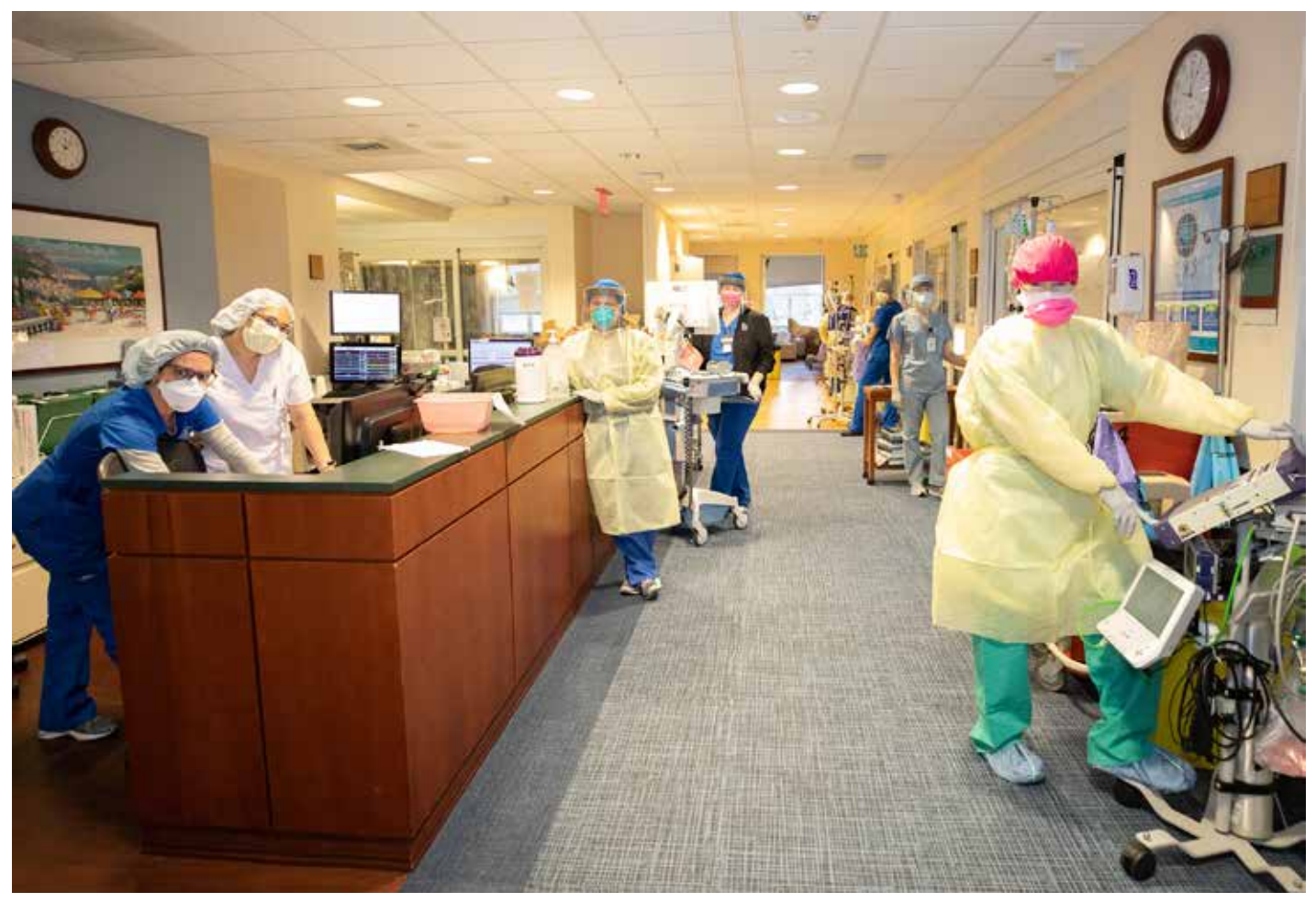
Nurses, physicians, respiratory therapists and others cared for COVID-19 patients in the Intensive Care Unit, which was expanded from 10 to 30 beds.

While the number of COVID-19 hospitalizations decreased during the summer, Greenwich Hospital prepared for an anticipated second wave, knowing its healthcare workers – now known as healthcare heroes – were poised to take on the challenge.