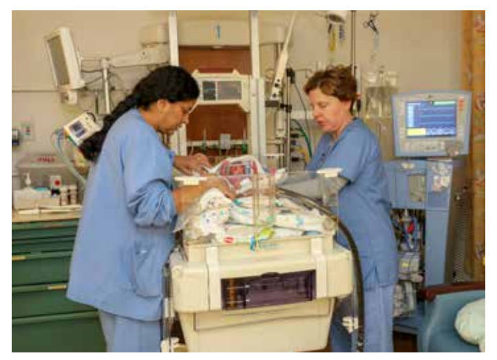
Greenwich Hospital's Neonatal Intensive Care Unit cares for premature and

Thousands of residents from Connecticut and New York relied on Greenwich Hospital for their health care in 2020. Inpatient discharges reached 12,737 for the year, with outpatient encounters at 253,779. The number of births, 2,814, increased over last year's total. The Emergency Department saw 32,534 visits.