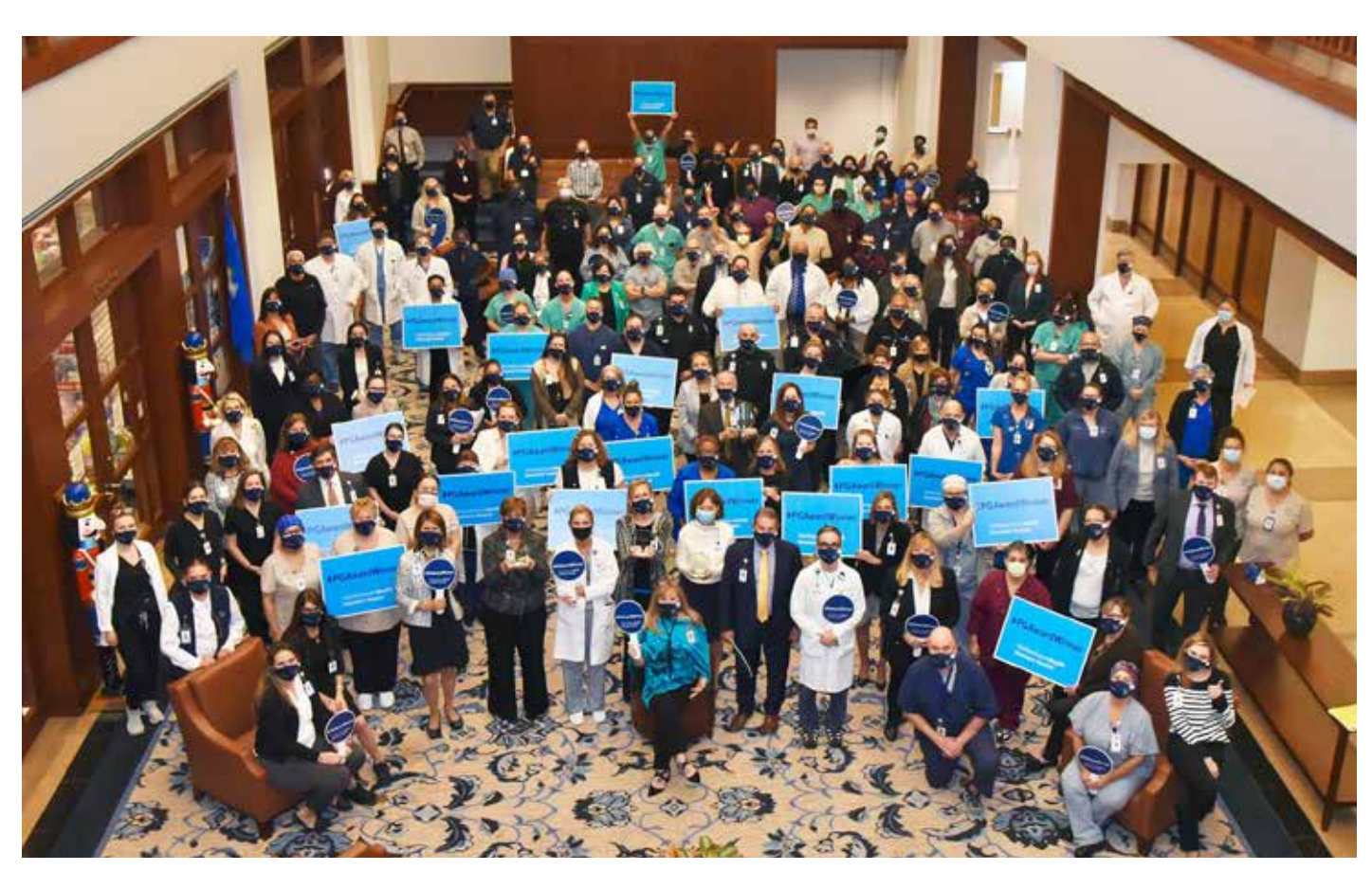
Greenwich Hospital's commitment to high-quality care and the patient experience garnered seven national recognitions.

In addition, the Greenwich Hospital Auxiliary met its financial commitment of $250,000 to support telestroke and pediatric services. It also funded four annual scholarships for high school graduates pursing healthcare careers.