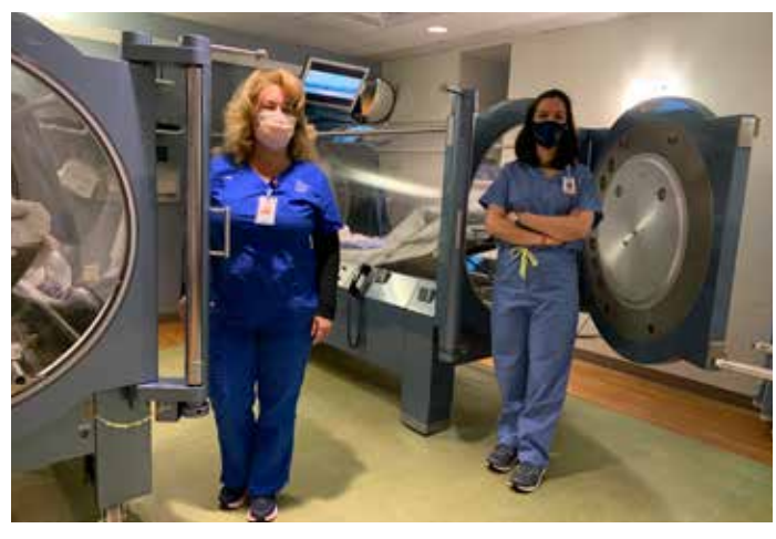
At Greenwich Hospital, hyperbaric medicine is often used to treat difficult-to-heal wounds that have not responded to traditional treatments and to COVID-19 patients during the pandemic.

Technology and video conference platforms proved valuable in continuity of patient care, especially during the pandemic. Patients and providers used MyChart video visits via Zoom video conference to conduct office visits virtually. Among other benefits, the move to Zoom allowed patients to grant access to adult children who don't live locally or otherwise can't join them for the appointment.