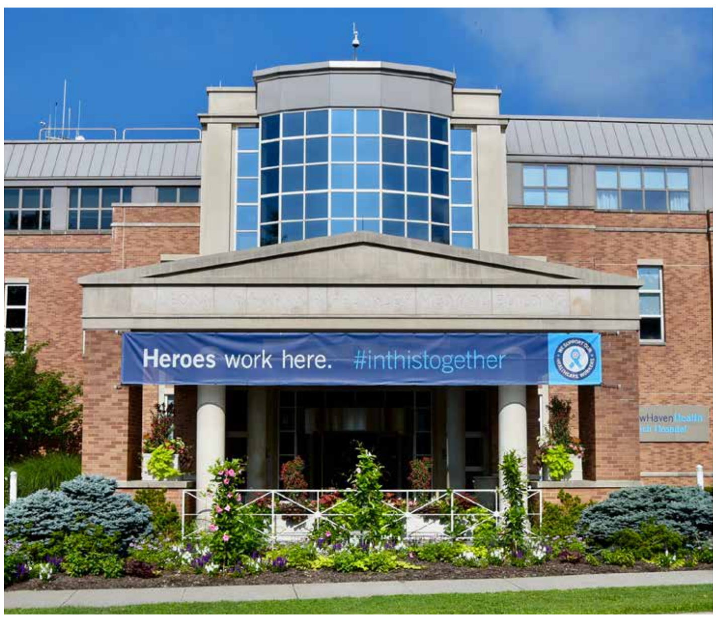
Greenwich Hospital is grateful to thousands of healthcare workers who rose to the challenge to care for COVID-19 patients.