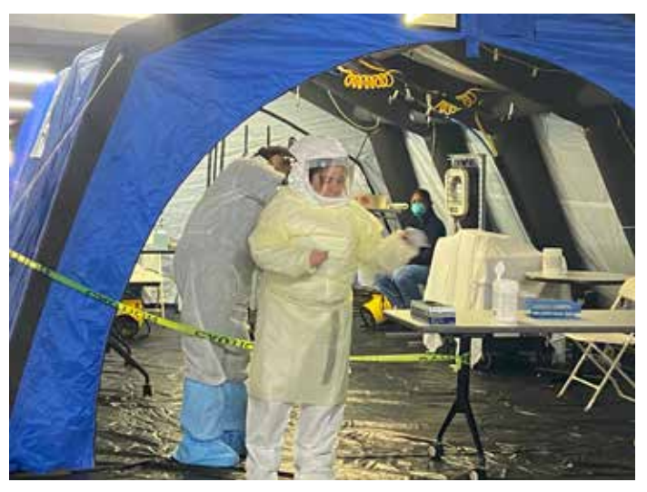
Greenwich Hospital was the first hospital in Connecticut to establish a drive-through COVID-19 testing site