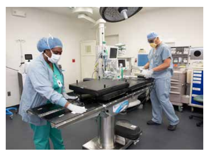
Greenwich Hospital resumed previously suspended clinical services, including elective surgeries, in May 2020. Staff meticulously followed safety protocols, including advanced cleaning and disinfecting in all areas.

By May, Greenwich Hospital began to resume clinical services that were suspended when the pandemic began. The hospital instituted numerous measures to protect staff, patients and visitors, including social distancing, additional COVID-19 screening and testing, and advanced cleaning and disinfection protocols.