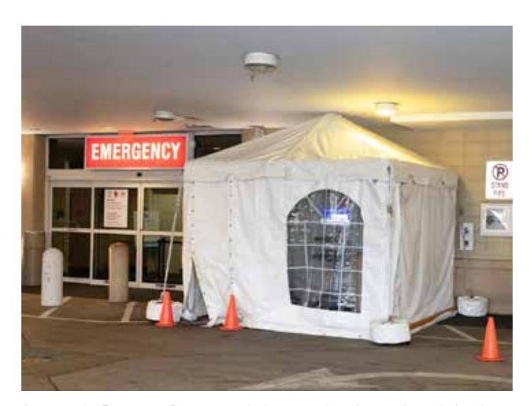
A tent on the Emergency Department deck was used to triage patients during the height of the pandemic to ensure safety.

The outpouring of support from the community was heartwarming. They donated 17,000 meals along with supplies, personal protection equipment, as well as $3.3 million to a variety of COVID-19 programs. Parades of first responders paid their respects to frontline employees. Residents sent messages of encouragement and posted thank you notes on doors, sidewalks and on social media. Although Greenwich Hospital suspended volunteer programs, the Auxiliary supported staff from afar by making masks and donating food. An anonymous couple made a generous gift to establish a dedicated, stateof-the-art unit for patients with infectious diseases, including COVID-19, and purchase powered air-purifying respirator suits to protect frontline staff.