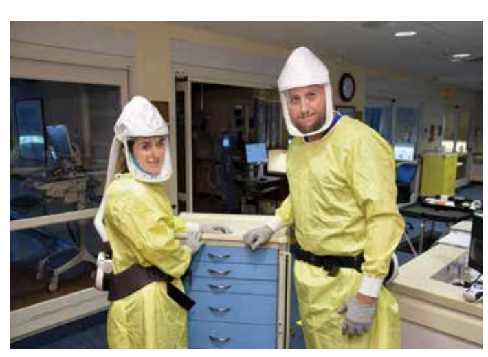
Intensive Care Unit nurses don powered air-purifying respirator suits to care for COVID-19 patients.