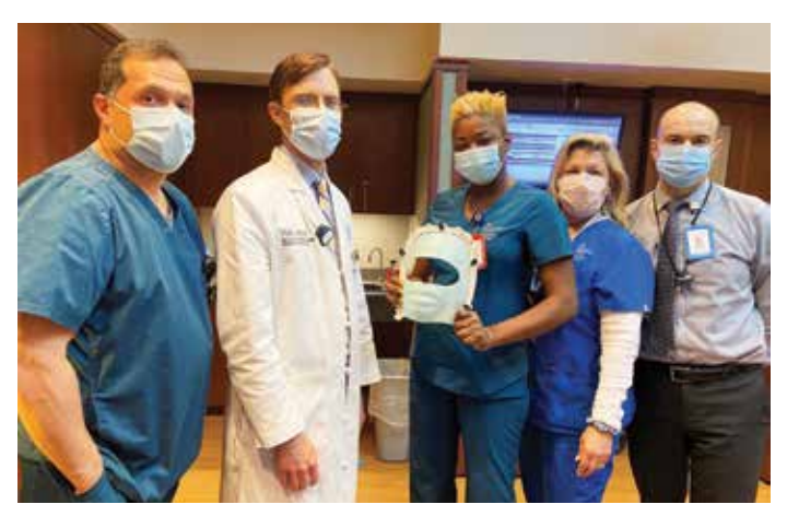
The radiation therapy team at Smilow Cancer Hospital Care Center in Greenwich combines skill and compassion.

Smilow Cancer Hospital Care Center in Greenwich expanded its services in the fight against cancer. In the area of radiation oncology, patients needing stereotactic radiosurgery had access to new technology that directly targets the radiation to tumors without using an immobilization head frame attached to their skulls.