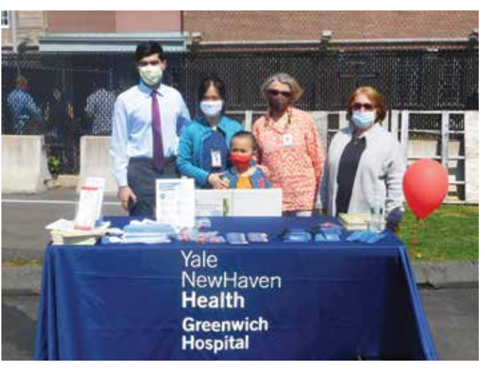
Community Health at Greenwich Hospital offered bike safety information at a