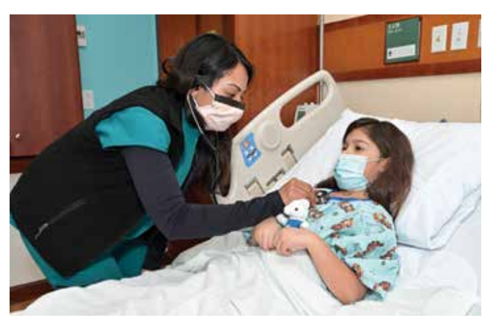
Yale Medicine pediatric hospitalists care for children in Greenwich Hospital's Pediatric inpatient unit.