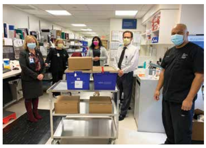
The Pharmacy department prepared to unpack the first shipment of the Pfizer vaccine

The fight against COVID-19 entered a new phase in February 2021 as Yale New Haven Health began administering vaccines to the public across Connecticut. Greenwich Hospital, in partnership with Brunswick School in Greenwich, opened a community vaccination clinic at the school. Hundreds of healthcare providers and volunteers worked tirelessly to vaccinate thousands of individuals.