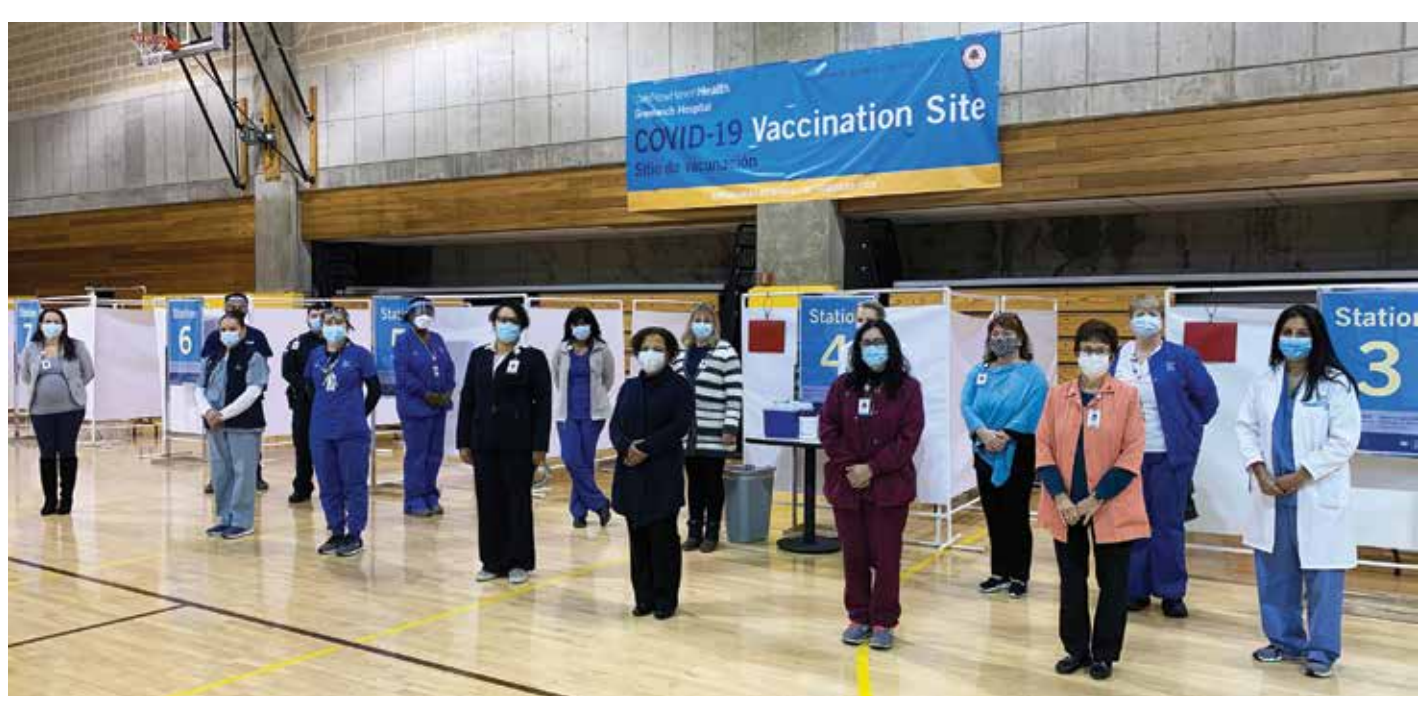
Hundreds of Greenwich Hospital employees and volunteers worked at the Yale New Haven Health community vaccination center at Brunswick School in Greenwich.