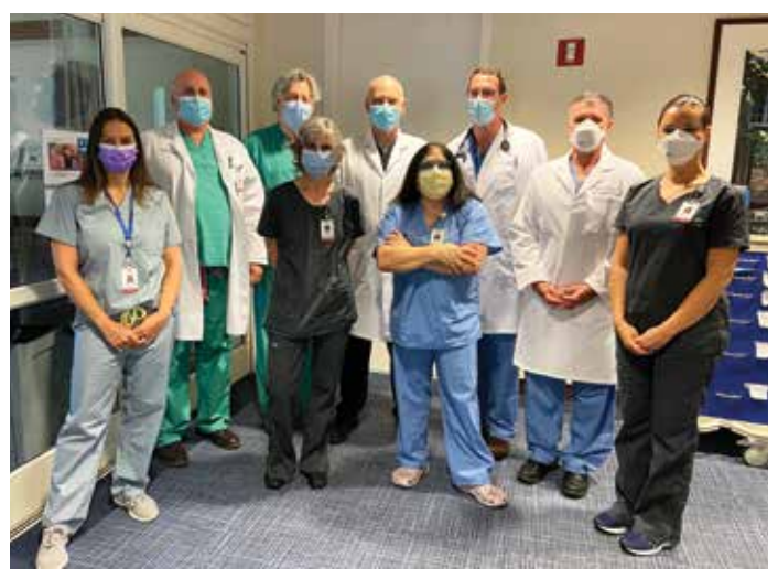
The physicians in the Intensive Care Unit cared for the sickest COVID-19 patients.