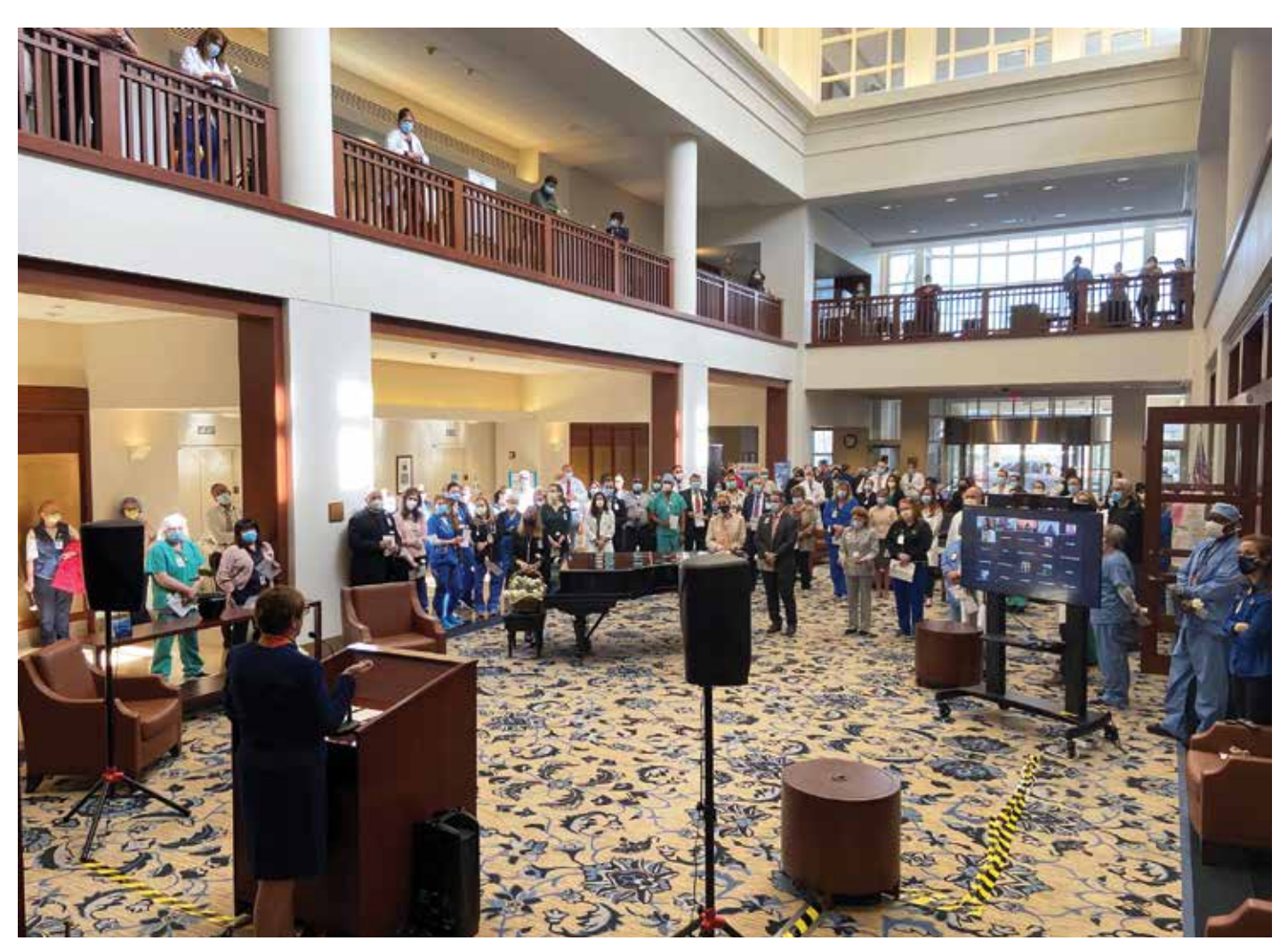
The one-year anniversary of the pandemic in Connecticut brought hospital employees together for a Pause to Remember.

To mark the one-year anniversary of the pandemic in Connecticut, Yale New Haven Health held a Week of Gratitude. On March 12, 2021, Greenwich Hospital leaders, doctors, nurses and other staff gathered for A Pause to Remember, a solemn reminder of the lives lost and the battle that lied ahead.