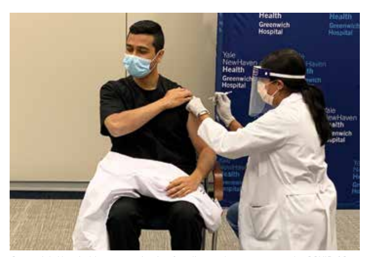
Greenwich Hospital began vaccinating frontline workers as soon as the COVID-19 vaccine was available.

Vaccine hesitancy, though, remained an obstacle, prompting Greenwich Hospital to take steps to dispel misinformation. Clinical staff appeared in webinars, radio shows and media outlets to instill confidence in the vaccination process. They also educated the public on ways the coronavirus impacted the lungs, heart and brain, putting some individuals at greater risk of developing strokes and suffering from lingering symptoms long after the active infection cleared.