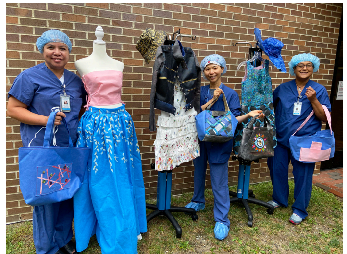
The creative nurses displaying their “green fashion” creations.

A team of Greenwich Hospital nurses created “ green fashion ” by upcycling material usually tossed in the garbage into sustainable couture, as well as practical items for everyday use. The nurses created fashionable items ranging from motorcycle jackets to floppy hats to chic dresses and purses out of material used to ship sterile surgical instrument trays. Their goal was to demonstrate the importance and beauty of recycling and their bags were displayed at the YWCA Old Bags Luncheon.