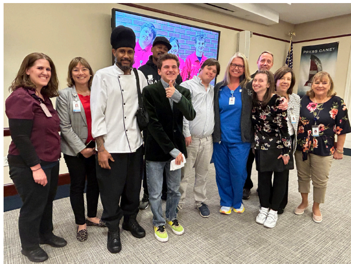
Project Search interns at their graduation ceremony accompanied by their Greenwich Hospital staff mentors and teammates.

Fifteen students with a true interest in health care were exposed to a robust curriculum, including five days of hospital tours, clinical simulations and career panels with frontline and behind-the-scenes staff at the Healthcare Explorers Program . More than 50 doctors, nurses, and staff from numerous departments participated.