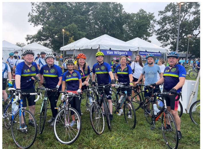
The Greenwich Hospital Freedom Riders at the "Closer to Free" ride in New Haven.