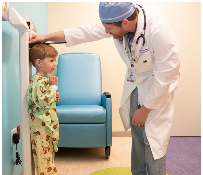
Pediatrician with patient at the new Pediatric Ambulatory Surgery Center.