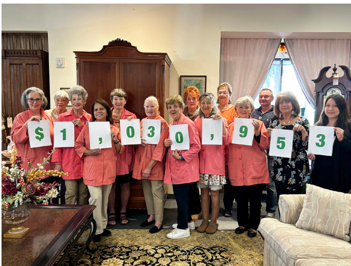
The Greenwich Hospital Auxiliary Thrift Shop team showing the amount of money they raised for the year.

The Office of Development raised $14,569,956 this year with the majority of the funds supporting Behavioral Health, the Emergency Department, Children's Health, Oncology, Heart and Vascular, Neuroscience and staff education. During both the silent and public phases of the Arc of Care Campaign, the Annual Fund for Greenwich Hospital also continued to thrive, crossing the $10 million mark. This fund provides hospital administration with the ability to designate dollars to where they are needed most.