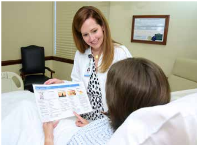
Ever mindful of enhancing the patient experience, Greenwich Hospital created a "Comfort Menu" that lists different ways patients can manage acute pain. The hospital garnered two coveted national awards for consistently excelling in patient experience.

Recognized as a national leader in patient experience, Greenwich Hospital received two coveted awards from Press Ganey, the nation's leader in measuring, understanding and improving the patient experience. The Pinnacle of Excellence Award in Patient Experience went to Outpatient Services for maintaining consistently high levels of excellence over multiple years, while the Emergency Department received the Guardian of Excellence Award in Patient Experience for consistently performing in the top 5 percent nationwide for one year. The hospital also received five 2019 Women's Choice Awards, including America's Best Hospital for Obstetrics, Breast Center, Cancer Care, Bariatric Surgery and Stroke Center.