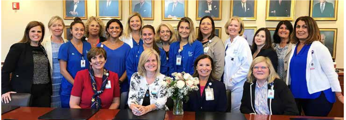
Greenwich Hospital's nurse residency program was awarded accreditation with distinction by the American Nurses Credentialing Center for helping new graduate nurses develop essential skills.