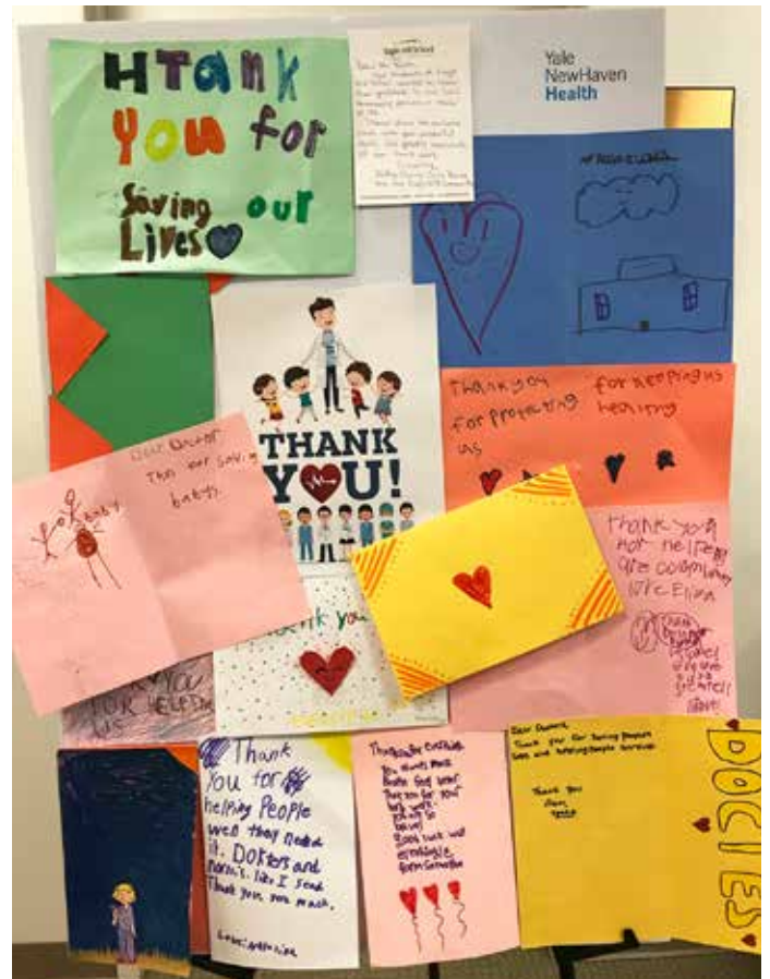
Students from Eagle Hill School in Greenwich expressed their gratitude to doctors and nurses with colorful, hand-crafted cards with messages such as "Thank you for helping people when they need it."

Greenwich Hospital remains committed to working with its community partners to deliver high-quality and compassionate care in a setting that recognizes the dignity of every patient.