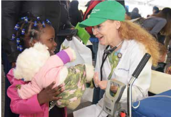
More than 1,800 youngsters and parents from Fairfield and Westchester counties attended Greenwich Hospital's annual Teddy Bear Clinic, a family-friendly outdoor mini-hospital under tents.