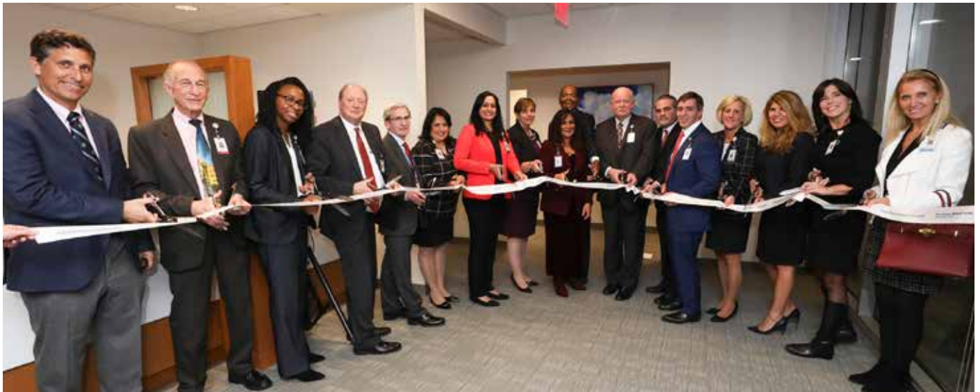
The new West Putnam Medical Center, a comprehensive outpatient facility located at 500 West Putnam Ave. in Greenwich, offers services from Greenwich Hospital, Yale New Haven Health Heart and Vascular Center, Yale New Haven Children's Hospital, Yale Medicine and Northeast Medical Group.

Greenwich took first place in Yale New Haven Health's annual nursing research conference for a study that looked at improving nurse self-efficacy for palliative care through simulation. The hospital's nurse residency program was awarded accreditation with distinction, the highest recognition awarded by the American Nurses Credentialing Center's Commission on Accreditation in Practice Transition Programs.