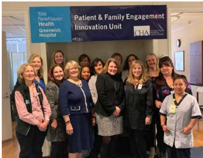
With its emphasis on patient-centered care, Greenwich Hospital was one of eight hospitals in Connecticut to partner with the Connecticut Hospital Association to have the first Patient and Family Engagement Innovation Unit.

Gifts to the Greenwich Hospital Foundation exceeded $8.6 million from more than 1,500 donors through the annual fund, major gifts supporting the clinical growth plan and special events. Donations included gifts to support neuroscience equipment and education, pediatric food allergy, the refurbishment of the ICU waiting room, pediatric clinical education and more.